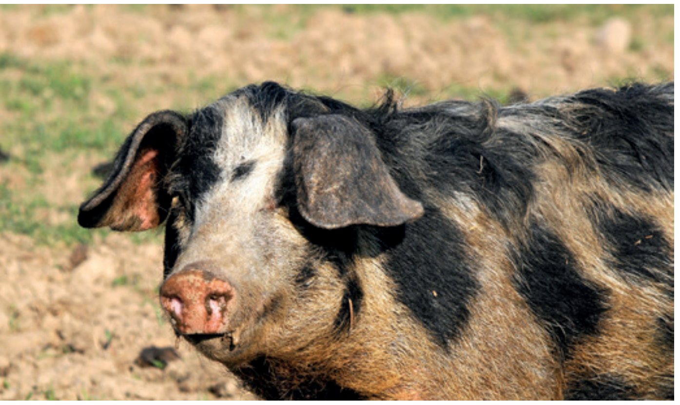
The genetic resources of old and modern animal breeds are worth preserving.

In 1985 the then Ministry of Agriculture (later the Ministry of Food, Agriculture and Fisheries) established the Committee for the Preservation of Genetic Resources in Danish Livestock, which has functioned up until 2012. The committee was tasked with contributing to the preservation of genetic resources in Danish livestock, and has been responsible for the overall coordination of the work on the genetic resources of livestock.