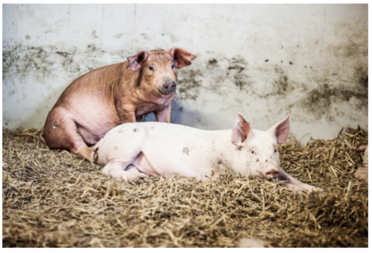
Research shows that many problems in pigs can be reduced by giving them suitable amounts of straw.

When it comes to finding out how the castration of male pigs can be avoided, scientists from Aarhus University are also involved. The knowledge on pig welfare that scientists from the Department of Animal Science generate could form a natural